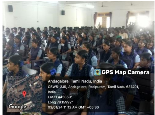
NSS volunteers and students took awareness pledge on vote in election on 24-01-2024.